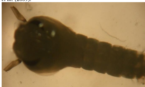
Figure 3. Deformed pupa with large abdomen filled with fluid resulted from egg treated with 0.25 mg/ml (left) compared with a normal pupa (right) (28 x).

The present percentage of mortality are higher than those reported by Bream et al. (2010) who exposed the second instar larvae of Culex pipiens to different concentrations of Echinochloa stagninum extract. They obtained the highest pupal mortality rates (25.60 and 33.3%) at concentrations of 4000 and 500 ppm respectively. Some of the pupae had abnormal shape possibly due to the large amounts of fluid in their bodies, (Fig. 2) similarly to those observed by Howard et al. (2009).