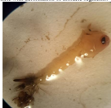
Figure 2. Dead larval- pupal intermediate (25x).

The existence of deformity in the dead larvae confirms the inhibition effect of the extract on the larval development which is similar to the effect of growth regulators. This agree with the findings of Mohsen et al. (1990) when they tested the Callistemon lanceolatus extract against Culex quinquefasciatus . They found cases of larval-pupal intermediate abnormalities including shortage or elongation of the abdomen and darkening of the cuticle with deformation of thoracic segments.