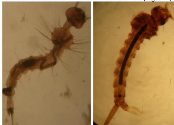
Figure 1. abnormal larva of Culex molestus (left) resulted from eggs treated with 0.25 mg/ml of tavrri extract compared with normal larva (right) (20 x).

The larval mortalities in the present study are relatively in accordance with those of Bream et al. (2009) who continuously exposed the 2nd instar larvae of Culex pipiens to different concentrations of Phragmites australis ethanolic leaf extract; they recorded 100% larval mortality at concentration of 400 ppm. The mortality is may be due to the action of some chemical compounds existed in the tavrri extract such as daphnechin, aquillochin and others (Rasool et al. , 2010) which may affected the epithelial cells of the alimentary canal (Ndione et al. , 2007). Growth abnormalities of the larvae were observed (Figure 1).