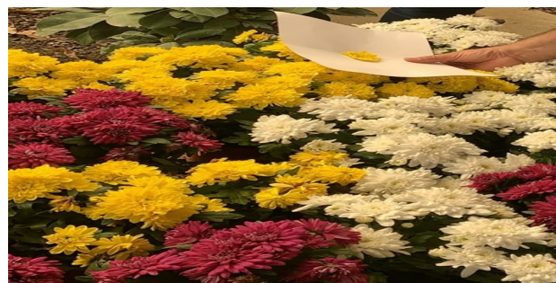
Figure 2. Capturing dataset samples