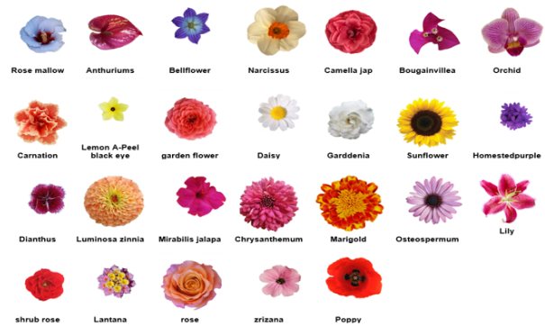
Figure 1. Dataset Image spices

A white background can highlight the object and help the system to better recognition. Most of researchers apply saliency-segmentation-based approaches to select the Region-Of-Interest (ROI) on flower images. The dataset has been designed and the images have been captured using white paper as a background as shown in Figure 2 . Then the dataset updated using Photoshop software to add the white background and show only flowers on the image without any noises. We had more similarity between the images in the normal dataset, then a similarity was very low after the dataset has been updated. The hardware devices that have been used for capturing the images of the dataset are (Nikon D3100, full HD, 14.2 MP), (Iphone Xmax mobile camera, full HD, 12MP), and (Canon EOS 1100D is a 12.2-megapixel camera). All samples are collected during 2 months (December 2019 and January 2020).