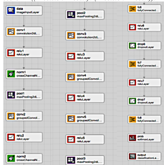
(a) Proposed CNN Layers