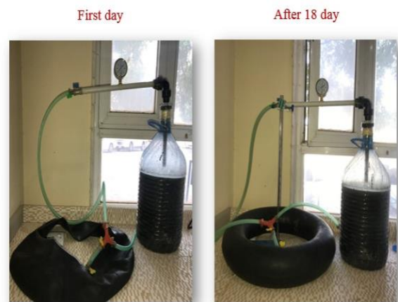
Figure 2. collection of biogases from anaerobic digestion of sewage sludge.

As indicated from Table 1 and Figure 2 the sludge of municipal wastewater of Zakho district is worth to be used for the generation of biogas and just 15 -17 kg sludge produced 233 to 350 \text{m}^3 gas in solid retention time of 18 and 24 day respectively. Anaerobic stabilization of sludge become common among the most facilities of wastewater recovery as it was effective in reducing the volume of sludge and cheap source of clean biogas around world. There are three main methods for sludge stabilization which are biological method by utilizing specific bacteria to degrade organic solids, chemical stabilization by using chemical oxidation of organic matter, and thermal stabilization by stabilizing organic fractions by heat. From these three methods the biological stabilization is most acceptable as it was the least expensive and eco-friendly practice. The part of organic solids that incorporated in the microbial biomass during degradation is called biosolids. Mesophilic anaerobic stabilization is more popular than aerobic stabilization because it is more efficient. Another advantage of anaerobic digestion is the concentration of macronutrients as nitrogen and phosphorous that can be used directly as organic fertilizer in fields and lawn or as ingredients in compost making which otherwise end up to river and water bodies to cause eutrophication.